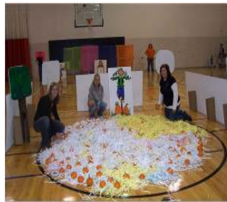
..The Pumpkin patch