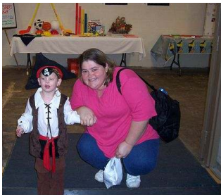
..Getting ready to enter

The Guernsey County Early Childhood Coordinating Committee recently sponsored their annual Community Child Find/Outreach event at the Cambridge YMCA with over 300 people attending. Children dressed in their costumes entered the gymnasium filled with exciting activities for them to try. Activities included a puppet show, the Bounce House, a photograph in front of a fall backdrop, and hunting for a pumpkin in a pumpkin patch. Other activities included a sensory maze, painting a pumpkin, and lunch. Some of the Community agencies participating included Guernsey County MRDD, Help Me Grow, Bright Beginnings, Health Department, Children's Services, Thompkins Child and Adolescent Center, and Head Start.