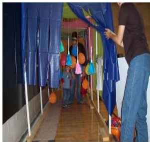
..through the Sensory Maze